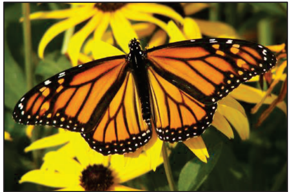
Female Monarch Butterfly