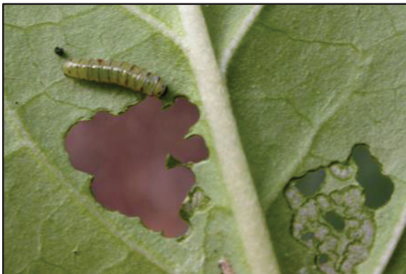
First instar feeding damage — This circular feeding pattern is an indication that a monarch first instar was on the plant at some point.