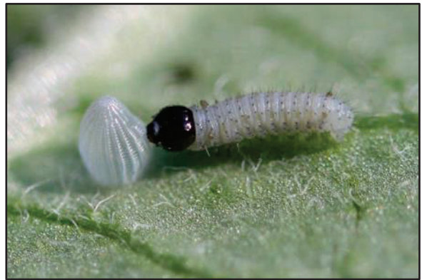
Monarch first instar consuming eggshell – Note the dull greenish-grey color, and the size (not much bigger than the egg).