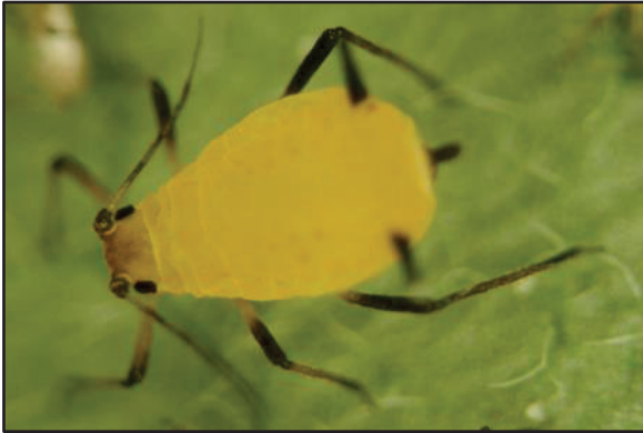
Aphis nerii – the only bright yellow aphid found on milkweed.