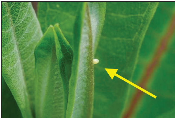
Monarch egg on milkweed leaf — The egg is a little more than 1 millimeter tall.