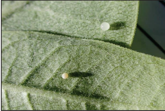
Monarch egg (left) and latex drop (right)