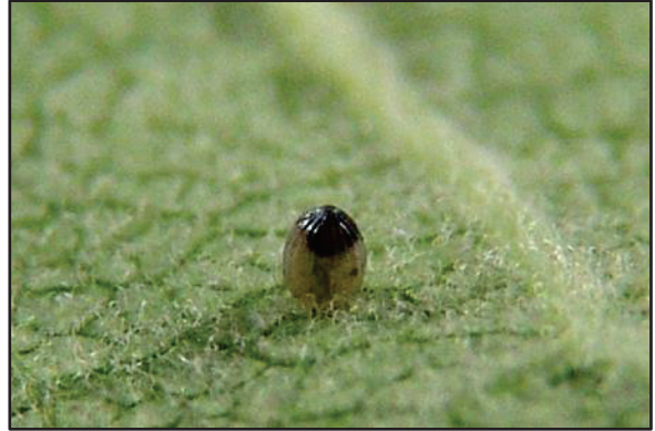
Live monarch egg about to hatch