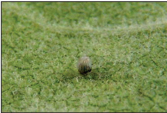
Dead monarch egg – Note the “puddle” of dead larva in the bottom of the egg.