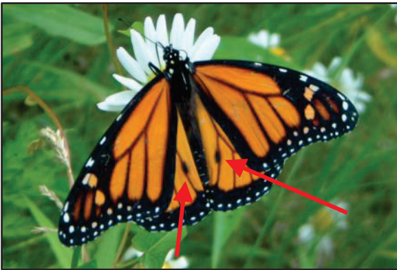
Male Monarch Butterfly

Male and female monarchs can be distinguished easily. Males have a black spot (indicated by a red arrow) on a vein on each hind wing that is not present on the female. The ends of the abdomens are also shaped differently in males and females, and females often look darker than males and have wider veins on their wings.