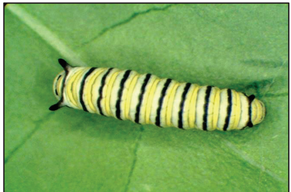
Monarch second instar — Second instar larvae have a distinct pattern of black, white, and yellow band, and the body no longer appears transparent and shiny.