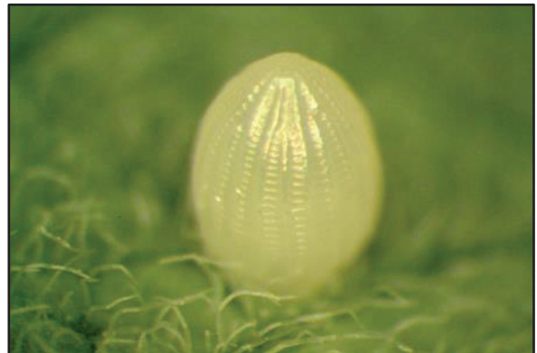
Close-up of monarch egg — Note the pointed shape, the glossy color, and the vertical striping.