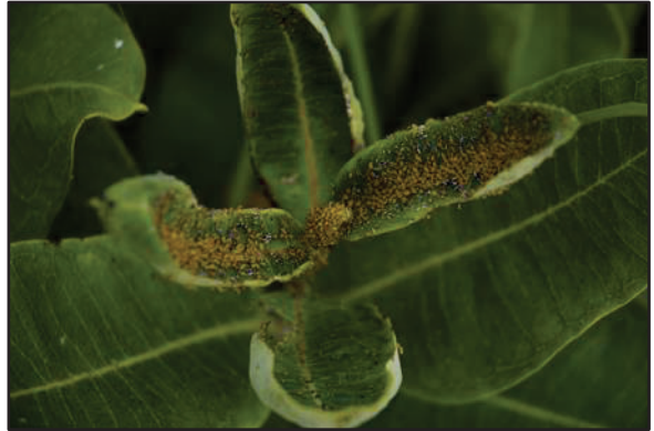
Aphis nerii – hundreds of aphids on one milkweed plant.